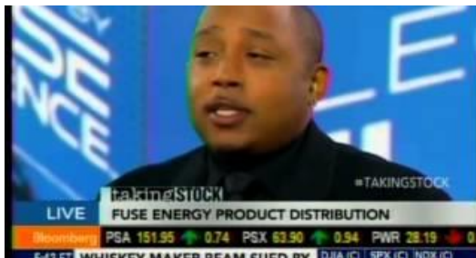
Bloomberg Television "Taking Stock"