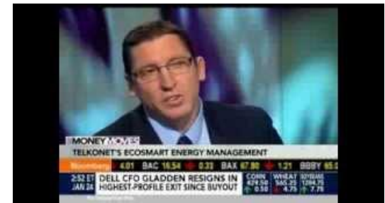
Bloomberg Television "Money Moves"