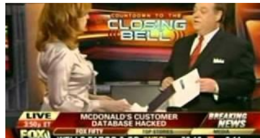
Fox Business "Closing Bell"