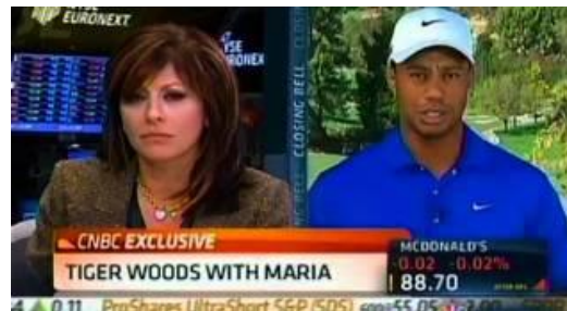
CNBC "Closing Bell"