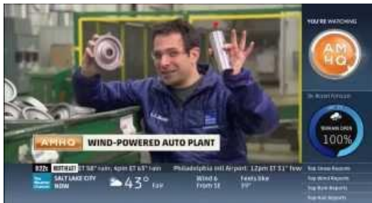
The Weather Channel

We have secured prime-time, live Business Television interviews for our clients, providing them with a national platform on which to tell their story to millions of investors.