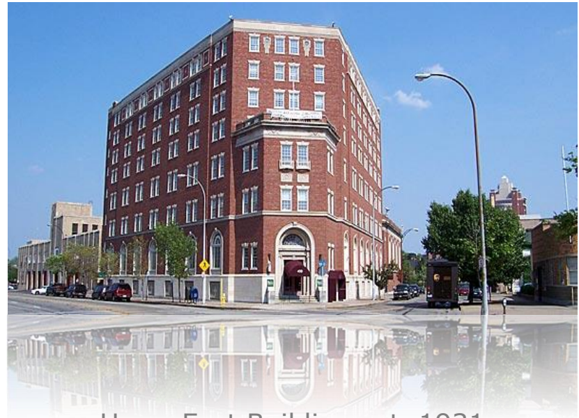
Harro East Building est. 1931