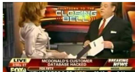
Fox Business "Closing Bell"