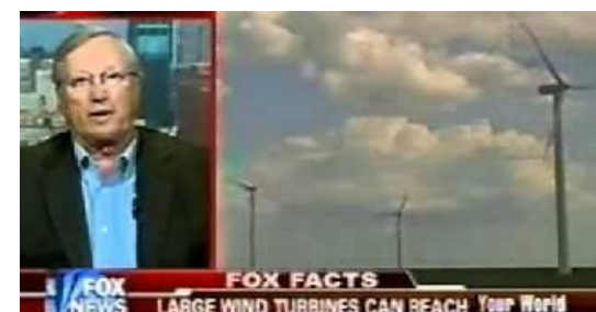
Fox News "Your World with Neil Cavuto"