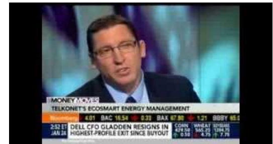
Bloomberg Television "Money Moves"